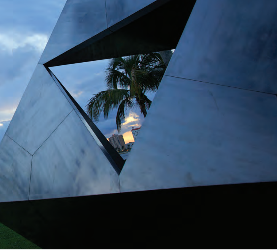
West Palm Beach skyline, as seen from The Society of the Four Arts, Palm Beach. Sculpture "Intetra" by Isamu Noguchi.