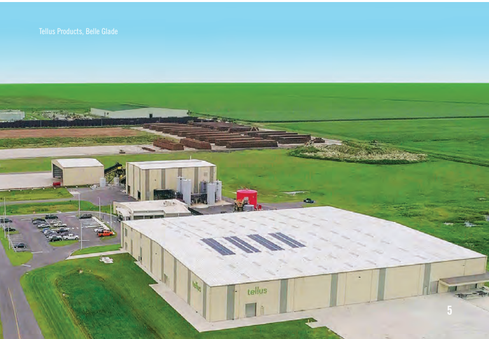
Tellus Products, Belle Glade

Employer-based incentive programs, administered by CareerSource and/or the State of Florida, are available. These programs are enacted and modified by laws at the federal, state, and/or local levels and can change at any time. On-the-Job Training provides employers financial assistance for training new