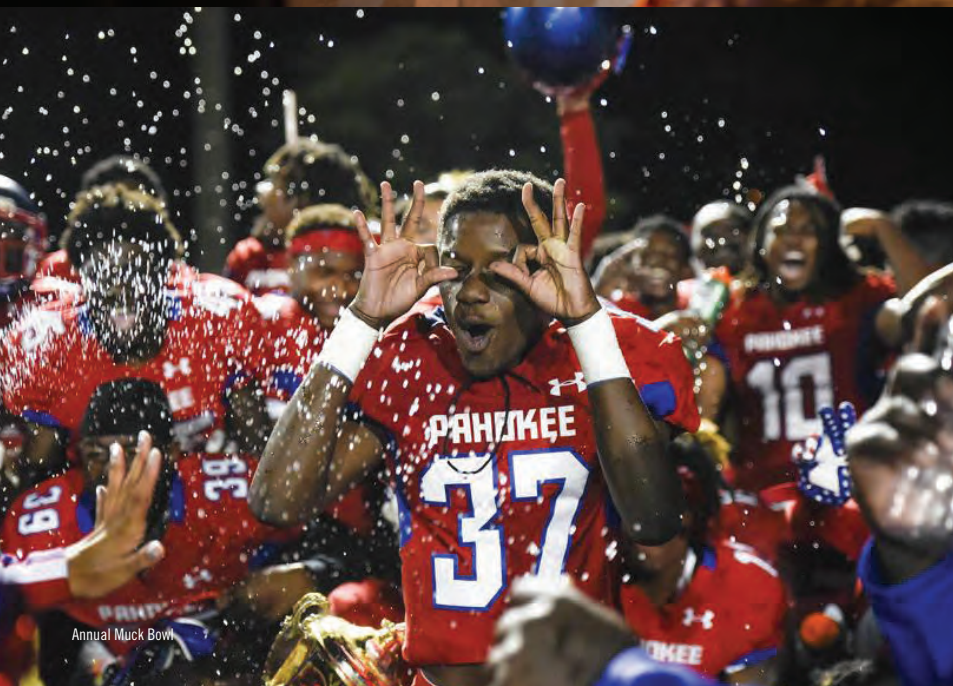
Annual Muck Bowl

The Glades Region offers a lifestyle that ranges from myriad outdoor activities on “Lake O,” to annual festivals, to arts and entertainment performances at the Dolly Hand Cultural Arts Center