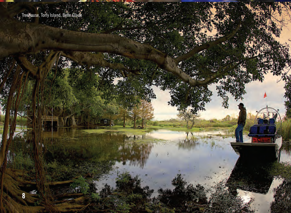
Treehouse, Torry Island, Belle Glade